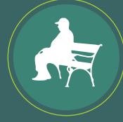
સીનીયર સીટીઝન પાર્ક