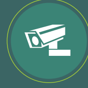
સીસી ટીવી કેમેરા