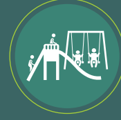
ચિલ્ડ્રન પ્લે એરિયા